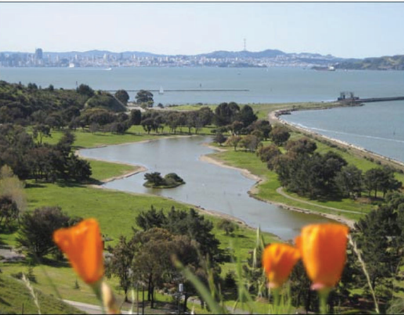
VIEW OF MILLER/KNOX PARK AND FERRY POINT

*Key community organizations. We recommend joining at least one.