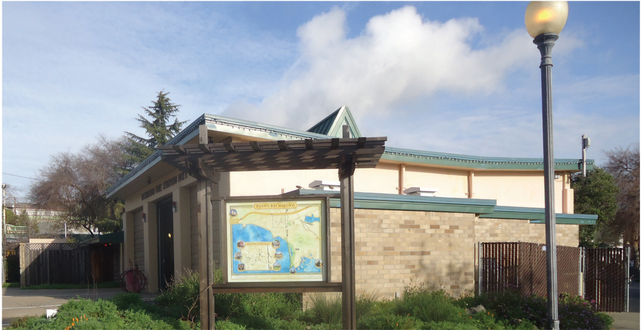
Corner of Park Place & West Richmond