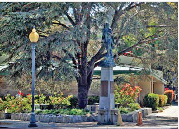
This is The Point

On behalf of Point Richmond, we warmly welcome you as our newest neighbor. Let us be clear - ALL are welcome here. We hope the following information helps you settle in and feel like a local.