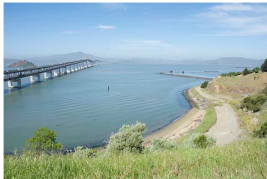
Chevron Shoreline Trail Easement

Prospects for the Point Molate Bay Trail advanced dramatically in 2014. The Bay Area Toll Authority (BATA) initiated design of a new trail between Marine St. and the Richmond/San Rafael (RSR) Bridge. BATA is working with the City, ABAG Bay Trail Project, TRAC and Bike East Bay in an effort to create an attractive trail that is wide enough for safe enjoyment by bicyclists and pedestrians separated from the freeway while staying within Caltrans right-of-way on the north side of I-580. Chevron donated to EBRPD a 0.9-mile easement to continue the Bay Trail from the RSR Bridge along the shoreline to Point Molate Beach. This sets the stage for EBRPD to partner with the City in continuing the Bay Trail from the beach park along the 1.4-mile shoreline of former Point Molate Naval Fuel Depot.