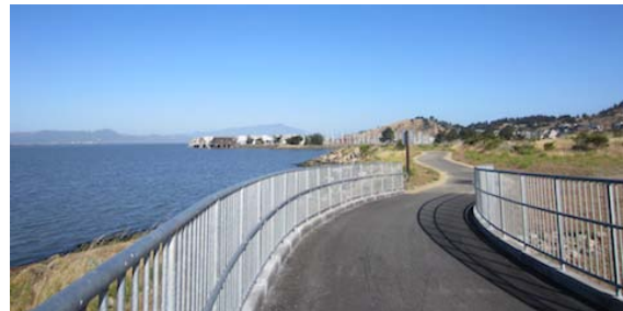
New Trail Linking Shipyard 3 Trail With Brickyard Cove Rd.

The City completed two new trail sections in 2014. One opened a scenic stretch of shoreline linking Brickyard Cove Rd. with the Shipyard 3 Trail along Canal Blvd. The other closed a gap along Brickyard Cove Rd. between Dornan Dr. near Ferry Point and the western side of Brickyard Landing condos. The $603,000 required to design and build these projects was provided by grants