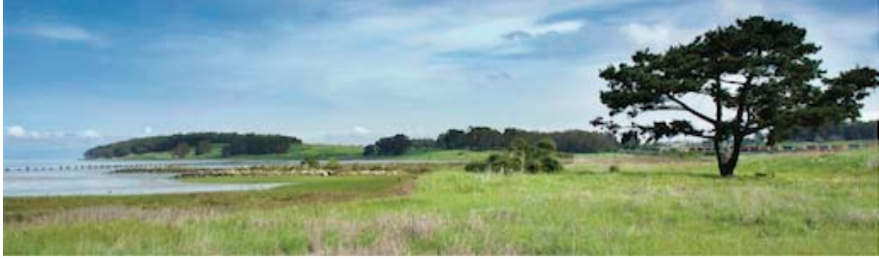
Point Pinole Viewed From Breuner Site Before Grading

The City of Richmond received a $63,000 grant from ABAG Bay Trail Project supplemented by $5,000 from EBRPD and $2,000 from TRAC to prepare plans for building a 0.4-mile Class I trail along Goodrick Ave. This will connect the Breuner Marsh Trail with the Class I Bay Trail parallel to the Richmond Parkway.