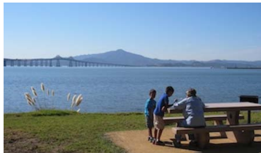
Point Molate Beach Park

More than half of Richmond's uncompleted Bay Trail -- 5.5 miles -- lies between The Plunge and Point San Pablo Yacht Harbor. The City took a first step in restoring public access to the Point San Pablo Peninsula's shoreline in March when it reopened Point Molate Beach Park with one-third mile of sandy shoreline. However, one cannot safely walk or bicycle to this beach with its spectacular Bay views.