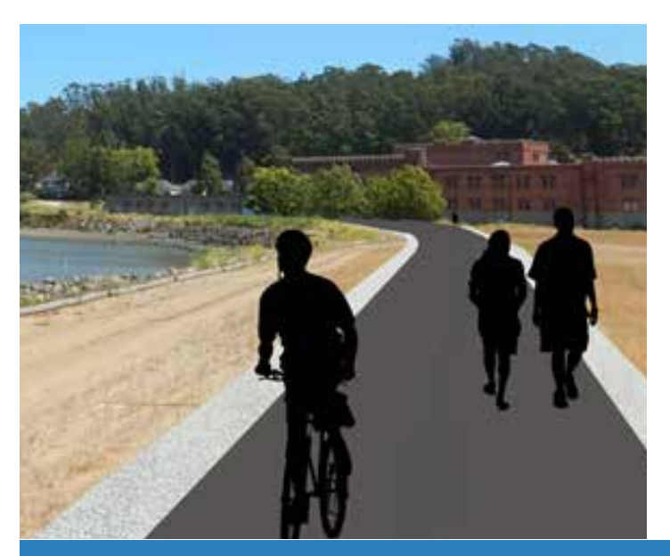
For more information on the Point Molate Trail, visit: https://www.pointrichmond.com/bay-trail/point-san-pablo/

The City and EBRPD each are seeking grant funds to construct sections of the Point Molate Trail extending 2.5 miles along the shoreline from the RSR Bridge to the northern border of the City's Point Molate property. This includes one mile of trail on a shoreline easement donated by Chevron and 1.5 miles on the City's Point Molate property. EBRPD has completed a preliminary design, approved a Mitigated Negative Declaration under CEQA and filed permit applications for the entire 2.5 miles. Plan Bay Area Priority Conservation Area grants of $2.0 million have been awarded, and applications have been filed for additional grants. This Point Molate Trail could be built as early as mid-year 2021 if a total of $6.5 million is obtained for construction.