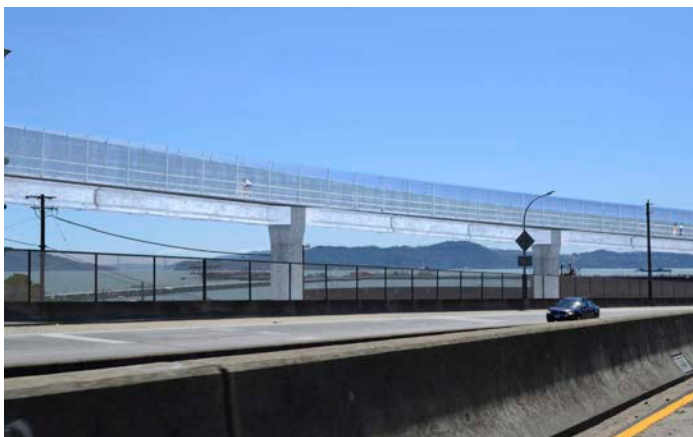
Conceptual Design of Bay Trail Flyover SE of Bridge Toll Plaza

The project is ready to move ahead with environmental review and final design through Caltrans' project approval process with assistance by Questa Engineering under contract to the City's Engineering Services Dept.. The City Council approved the local consensus trail alignment, and Contra Costa Transportation Authority awarded a $200,000 Measure J grant to reimburse Caltrans for its participation.